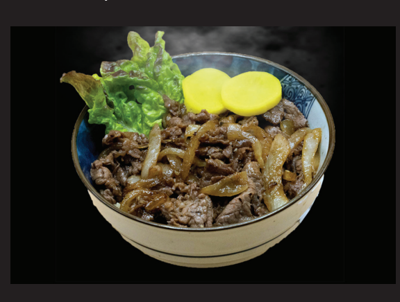
$ 16.75 Grilled sliced beef and onion over rice with special BBQ sauce.

Buta Don $ 14.75 Grilled pork with scallions and soft-boiled egg over rice.