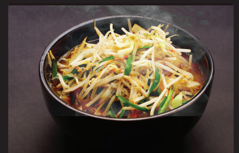
Best Condition Ramen $ 14.75