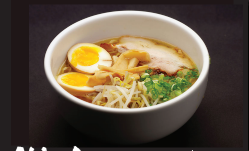
Stio Ramen $ 13.25 Egg noodle in a flavorful clear chicken broth with tender braised pork, soft-boiled egg, scallions bean sprouts and bamboo shoots.