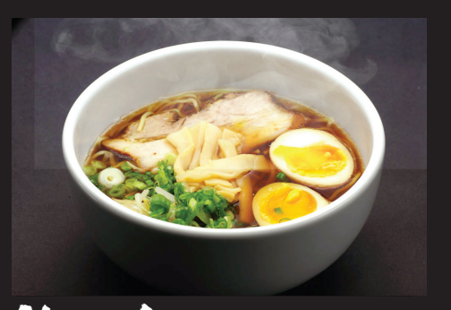
Stoyu Ramen $ 13.25 Egg noodle in a soy-based chicken broth with tender braised pork, softboiled egg, scallions, bean sprouts and bamboo shoots.