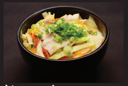
Chanpon Ramen $ 15.75

Egg noodle in a creamy egg chicken broth with spicy ground pork, garlic, and scallions.