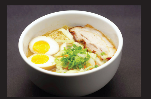
Miso Ramen $14.75 Egg noodle in a miso-based rich pork broth with tender braised pork, soft-boiled egg scallions and vegetables.