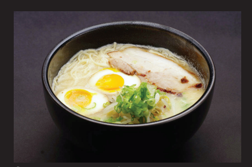
Tonkotsu Ramen $14.75 Egg noodle in a rich pork broth with tender braised pork, soft-boiled egg, scallions and bean sprouts.