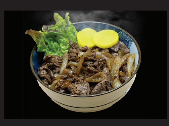
Grilled sliced beef and onion over rice with special BBQ sauce.

Buta Don $ 14.75 Grilled pork with scallions and soft-boiled egg over rice.