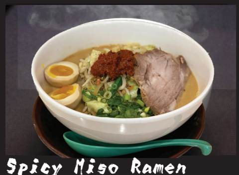
Egg noodle in a miso-based rich pork broth. Tender braised pork soft-boiled egg and stir-fry vegetables with special spicy paste.

$14.75 Egg noodle and vegetables in a creamy soup made of soy beans