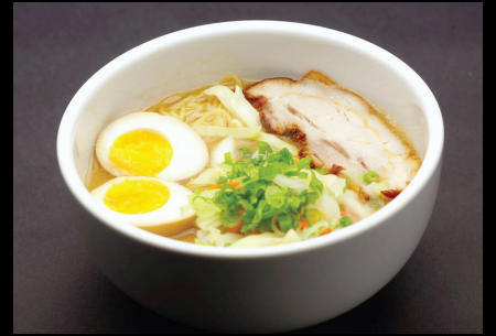
MISO $15.75 SPICY MISO 🌶️ $16.75 Egg noodles in a miso-based rich pork broth with tender braised pork, a soft boiled egg, scallions, and vegetables.