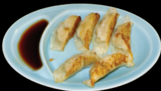
GYOZA $7.25 Pork dumplings.