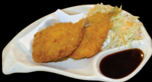
AJI FRY $7.95 Deep fried horse mackerel.