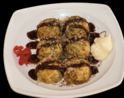
TAKO YAKI $7.95 Puffy octopus dumplings with special sauce.