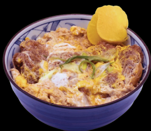
KATSU DON $15.95 Deep fried pork, onions and egg over rice.