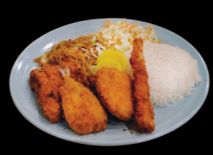
FRIED COMBO BENTO $17.75 Assortment of deep fried fish, prawn, pork and potato croquette.