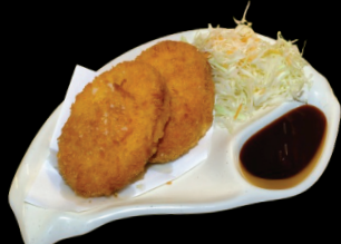
VEGETABLE CROQUETTES $7.95 Deep fried mashed potatoes.