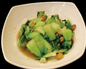
AONA ITAME $9.95 Sautéed baby bok-choy.