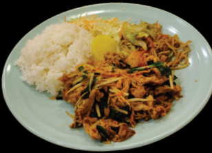
BUTA KIMCHI BENTO $17.75 Stir fried pork, kimchi and bean sprouts.