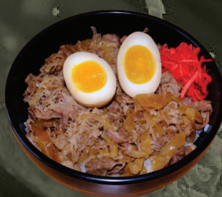
CHUKA DON $17.25 Pork, vegetables, seafood with chicken flavored sauce and a soft boiled egg over rice.