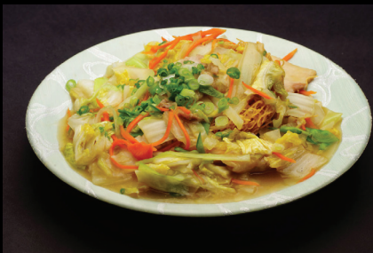
SARA UDON $16.95 Crispy egg noodles in a chicken flavored sauce with seafood, pork and vegetables.