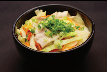
CHANPON $16.75 Egg noodles in a rich pork broth with seafoods, pork and vegetables.