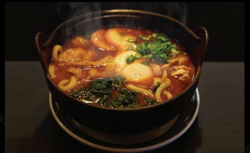
MISO NIKONI UDON $17.25 Udon noodles with special miso broth, fish cake, napa cabbage, scallions, chicken and an egg.