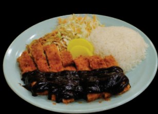
MISOKATSU BENTO $16.75 Deep fried pork with miso sauce.

comes with yakisoba, white rice and soup (Fried Rice Bento doesn't come with white rice)