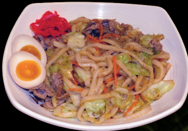
YAKI UDON $14.95 Stir fried udon noodles with pork, vegetables and a soft boiled egg.