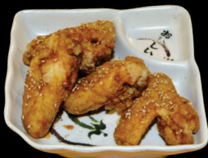
TERASAKI $8.25 + Spicy 🌶️ $8.95 Deep fried chicken wings.