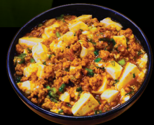
Mabo DON 🌶️ $14.75 Spicy ground pork, garlic, tofu and scallions over rice.