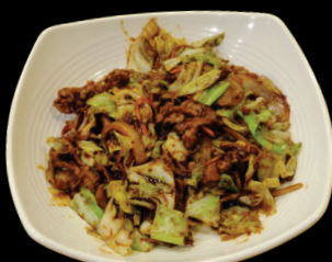
BUTA MISO ITAME $14.95 Miso flavored stir fried pork with vegetables.