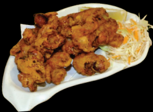
TAKO KARAAGE $9.75 Deep fried octopus.