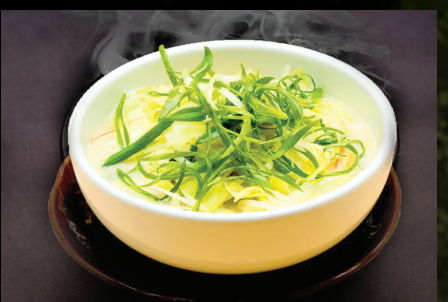
VEGETARIAN $15.75 Egg noodles in a creamy soy bean and wheat based broth with vegetables.