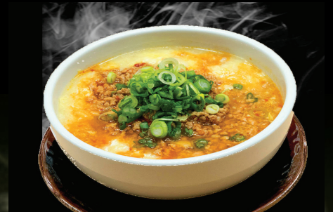
TAMAGO TAIWAN 🌶️ $15.75 Egg noodles in a creamy egg chicken broth with spicy ground pork, garlic and scallions.