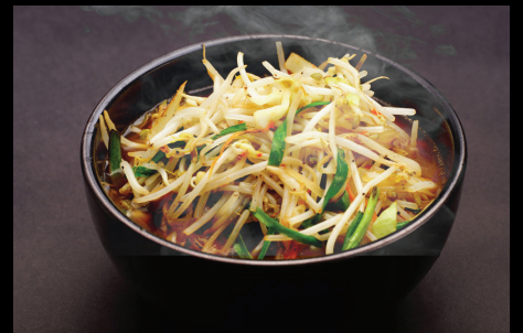
BEST CONDITION 🌶️ $15.75 with Vegetarian broth $16.75 Egg noodles in a flavorful chicken broth with garlic and spicy stir fried vegetables.