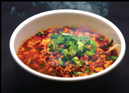
TAIWAN 🌶️ $14.75 Egg noodles in a flavorful chicken broth with spicy ground pork, garlic, scallions, bean sprouts and green chives.