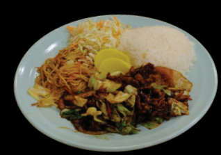
BUTA MISO BENTO $17.75 Miso flavored stir fried pork and vegetables.