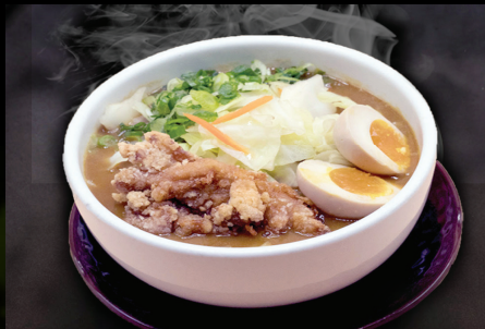
CURRY RAMEN $16.75 Egg noodles in a curry flavored rich pork broth with fried chicken, a soft boiled egg, vegetables and scallions.