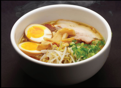
SHIO $14.25 Egg noodles in a flavorful clear chicken broth with tender braised pork, a soft boiled egg, scallions, bean sprouts and bamboo shoots.