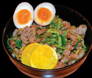
BUTA DON $15.95 Stir fried pork with scallions and a soft boiled egg over rice.