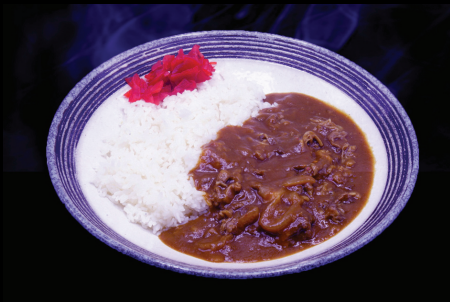
BEEF CURRY $16.50 Curry and rice with simmered beef and onions.