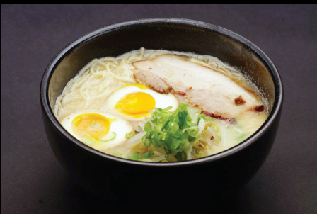
TONKOTSU $15.75 Egg noodles in a rich pork broth with tender braised pork, a soft boiled egg, scallions, and bean sprouts.