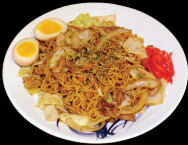
YAKISOBA $14.95 Japanese stir fried noodles with pork, vegetables and a soft boiled egg.