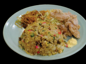
FRIED RICE BENTO $15.75 Fried rice and two pieces of fried chicken.