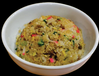
FRIED RICE $7.25 small $11.75 large Rice, egg, scallions, chopped pork and fish cake.