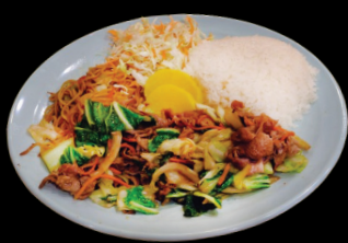
STAMINA BENTO $17.75 Stir fried pork, onions and napa cabbage with spicy garlic sauce over rice.