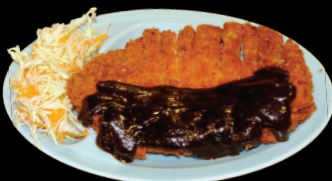
MISOKATSU $10.25 Deep fried pork with miso sauce.