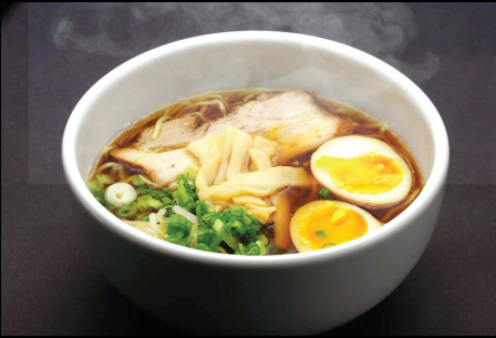
SHOYU $14.25 Egg noodles in a soy-based chicken broth with tender braised pork, a soft boiled egg, scallions, bean sprouts and bamboo shoots.