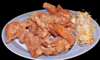
KARAAGE $6.95 small $11.95 large Japanese fried chicken.