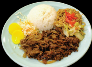
BBQ BENTO $19.75 Stir fried beef and onions with BBQ sauce.