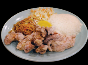
KARAAGE BENTO $15.75 Japanese fried chicken.